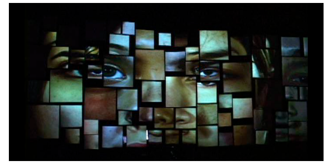
Figure 1. in a thousand drops... refracted glances installation

in a thousand drops... refracted glances is an audiovisual environment that constructs and deconstructs bodies through processes of stitching, repetition, collage, stretching, contraction, multiplication and reduction. As a result of these processes new hybrid fugal bodies are born that speak to the variety and complexity of the ecological and interpersonal balances that depend on the mutual interdependencies of the community of agents that make up its population.